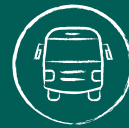
Transport and Outings